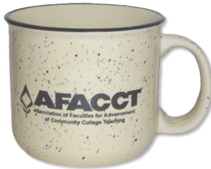
Vintage AFACCT mug, circa 1994

The AFACCT Mug: What has become inevitable at each annual conference is the coveted AFACCT beverage mug. Every conference attendee gets one, so ask for yours at the Registration Desk when you hand in a conference evaluation form.